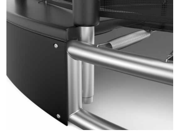
Extremely easy assembly with AkroClick system