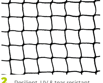
Resilient, UV & tear resistant, full net enclosure